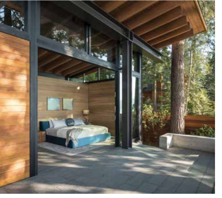
THIS PAGE CLOCKWISE FROM TOP: The built-up roof was constructed using clear span re-sawn rafters that are sitting on heavy gauge steel I-beams spanning 91 feet. Installed by Vertical Iron Works, the steel structure supports the roof load and allows the large sliding glass door opening | The primary suite has its own 15-foot-wide sliding glass wall that allows easy access the lakeside patio The 10-foot-tall entry pivot door served as the datum point of the entire house—where the exterior walkway leading from the garage to the home precisely lines up to the center of the great room and lakeside patio doors OPPOSITE PAGE FROM TOP: The office has custom scraped walnut floors along with T&G knotty cedar ceilings to provide the room with some warmth | Bentwood walnut cabinetry with integrated matte black pulls by Truckee Tahoe Lumber Design Center create clean horizontal lines

windows and doors. In fact, that was the requirement for all woodwork on the project.